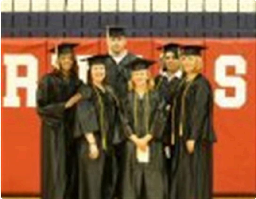
Shen U 2008 Leesburg Campus